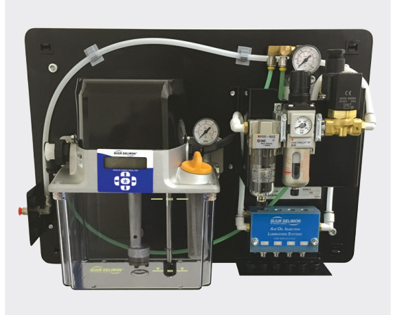
SureFire 4-Point Air-Oil Panel