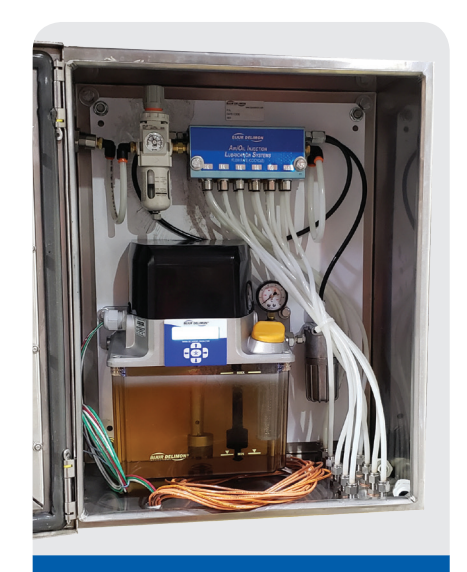
SureFire 12-Point Air-Oil System