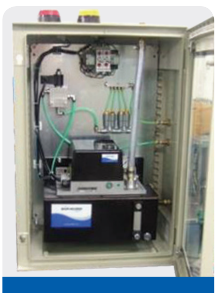
GPO Oil System